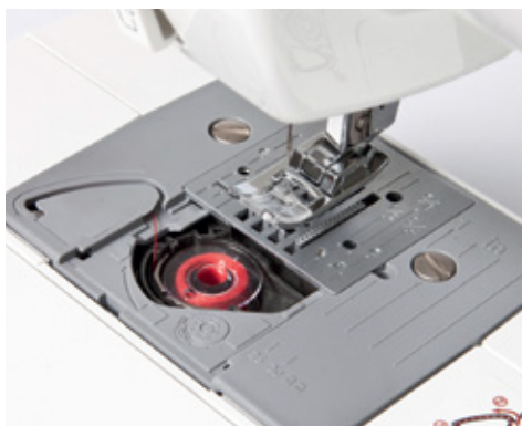
Quick-set bobbin. Just drop in a full bobbin and you are ready to sew.