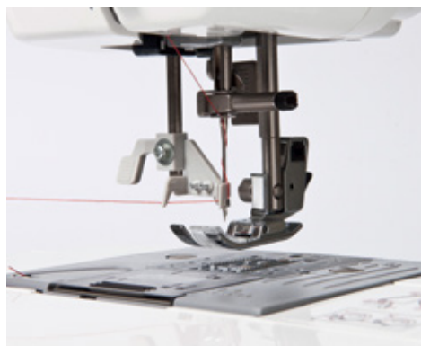
Easy automatic needle threading.