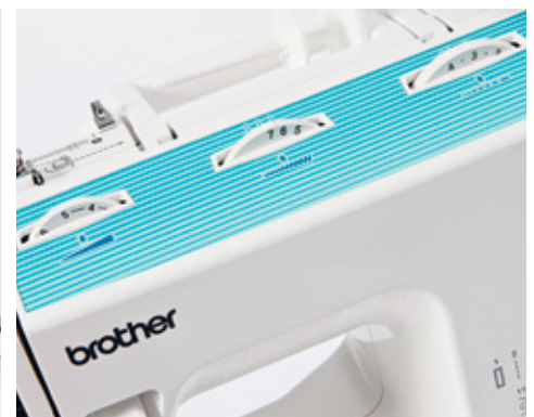
Centrally located thread tension and adjustment dials.

Wide range of optional accessories available.