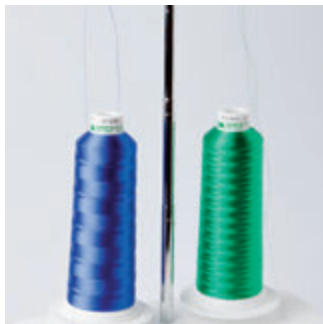
King Spool thread stand