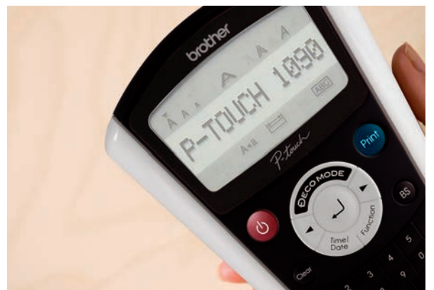
Using the built-in clock, you can add today's date to your label with a simple press of the date key

Clearly label all your file folders, CD's, shelves and archive files with the P-touch 1090, for the perfectly organised office and home