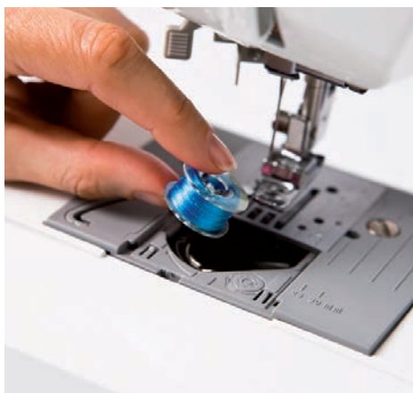
Quick-set bobbin – just drop in a full bobbin and you are ready to sew