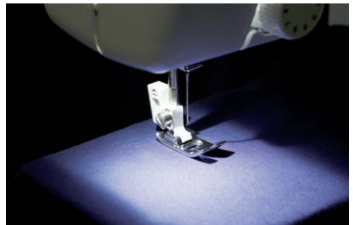
LED lighting for easy viewing