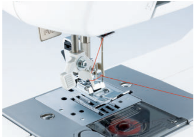
Easy automatic needle threading