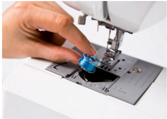
Quick-set bobbin – just drop in a full bobbin and you are ready to sew

Wide range of optional accessories available including quilting feet, etc.