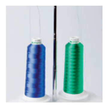
King Spool thread stand