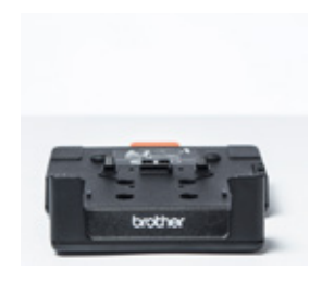
PA-CR-002 Single charging cradle