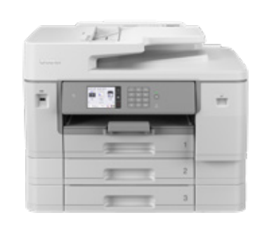
Business Inkjet Devices