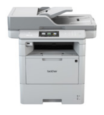
Professional Monochrome Laser Devices