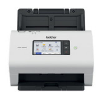
Business Document Scanners