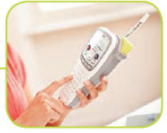
Lightweight, compact design