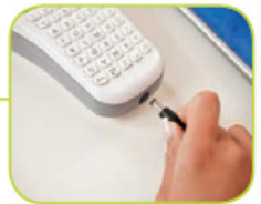
AC adapter slot