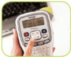
Cabel labelling feature