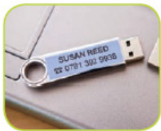
Over 170 symbols