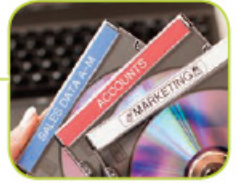
Design creative labels