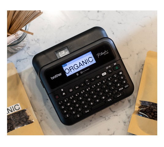
High resolution LCD display