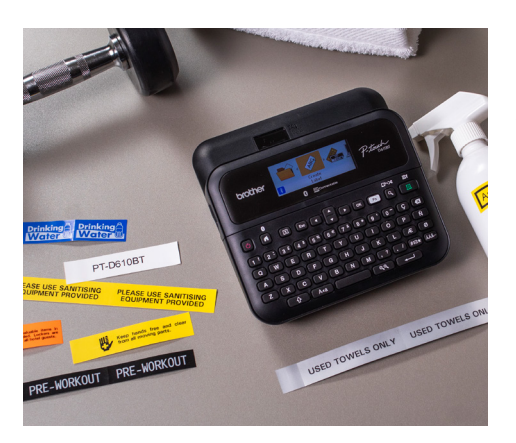
Over 170 different label templates to choose from