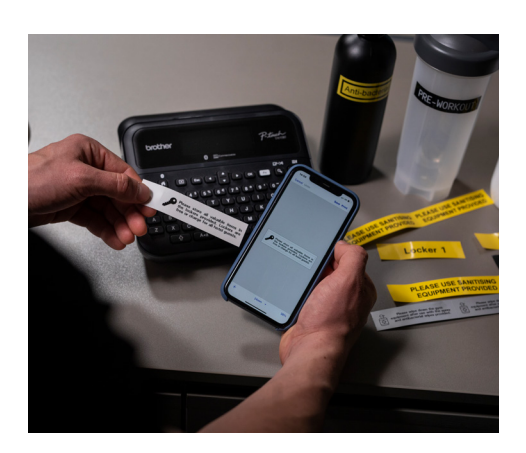
Print from your smartphone via Bluetooth