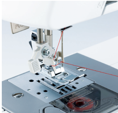
Easy needle threading

Wide range of optional accessories available including quilting feet, etc.