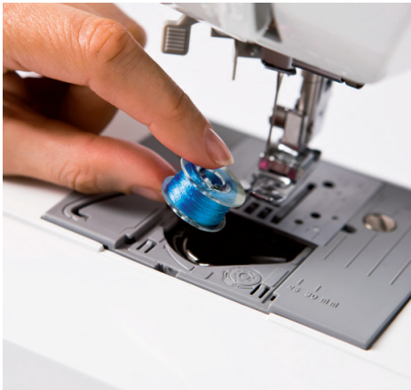
Quick-set bobbin – just drop in a full bobbin and you are ready to sew