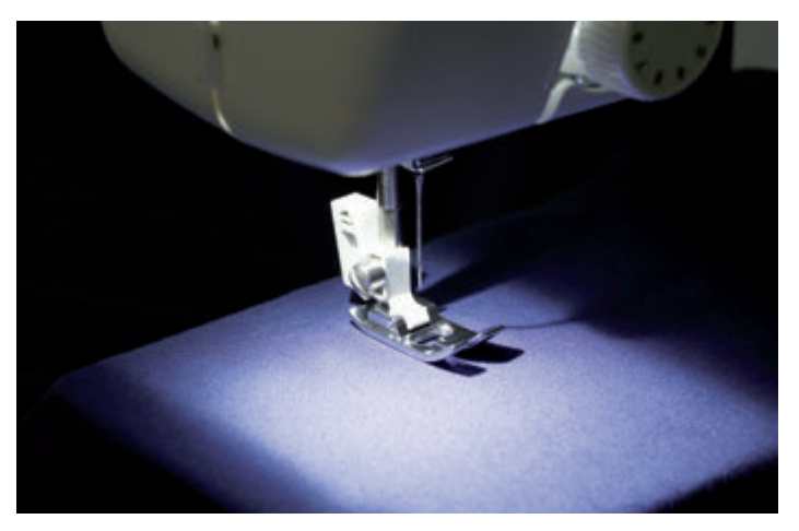
LED lighting for easy viewing