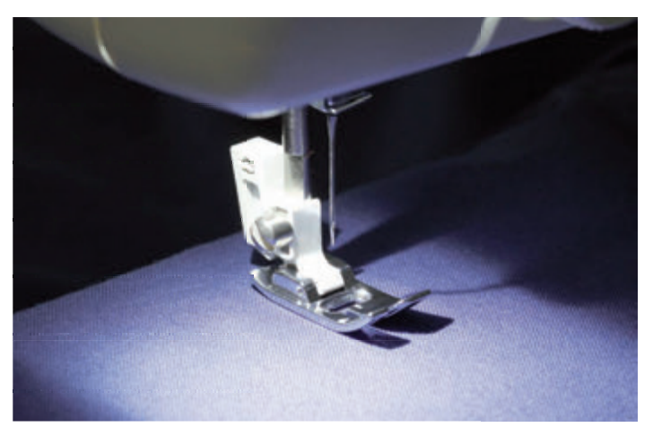
LED lighting for easy viewing