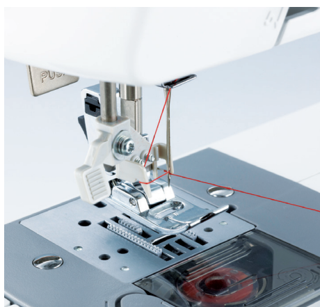
Easy needle threading

Wide range of optional accessories available including quilting feet, etc.