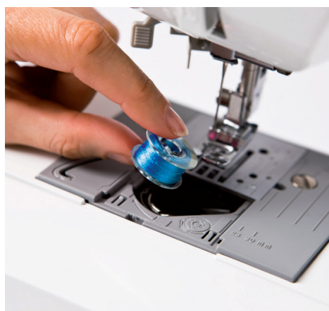
Quick-set bobbin – just drop in a full bobbin and you are ready to sew