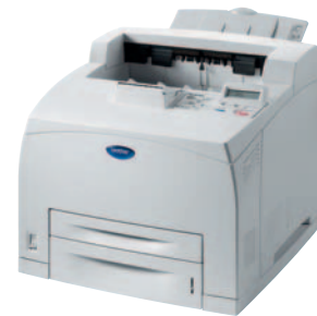
HL-8050N (Optional lower tray available) ■ Network Interface as Standard