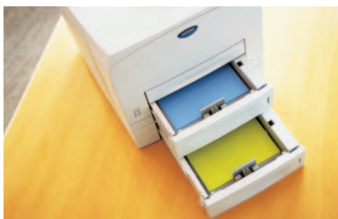
Up to four paper trays Stores different stock, size and colour