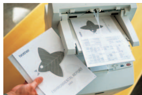
Duplex Unit Maximise cost-effectiveness with double-sided prints