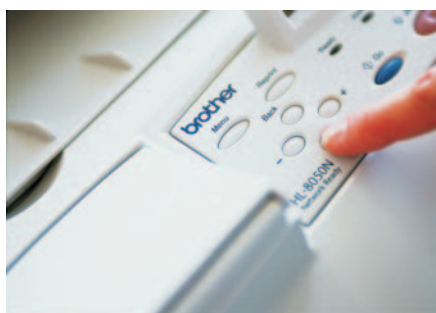
Control Panel Keeping everything clear and simple