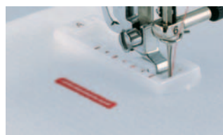
4-STEP AUTOMATIC BUTTONHOLER