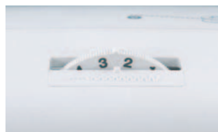
STITCH WIDTH & NEEDLE POSITION ADJUSTMENT