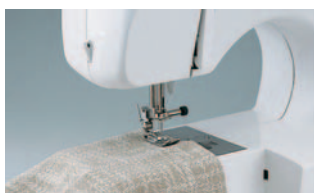
FREE ARM SEWING