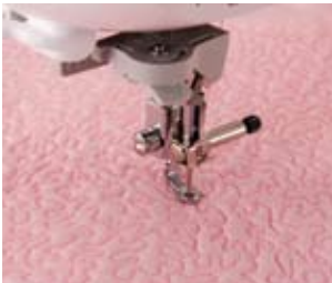
Free Motion "C" foot For greater visibility.

Includes three new free-motion presser feet and extra wide sewing table