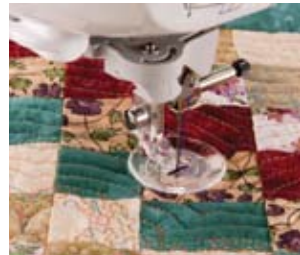
Echo "E" foot For perfect Echo quilting.