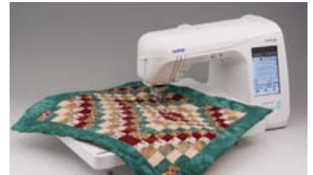
Handle large sewing projects easily Use the Extra-wide table to easily handle large projects like quilts and wall hangings.