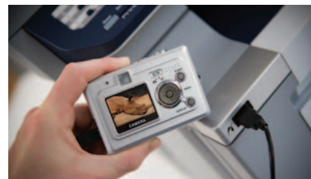
Direct Photo Printing Via camera using PictBridge or from USB memory drive

Brother gives you colour printing, faxing, copying and scanning together. The MFC-9840CDW does everything in one reliable, networked space saving solution.