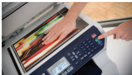
Stylish, user-friendly design Control panel designed to maximise usability