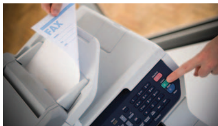
Automatic Document Feeder For easy faxing / copying / scanning of multi-page documents