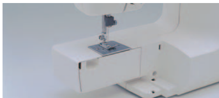
FREE ARM FOR SLEEVES AND CUFFS