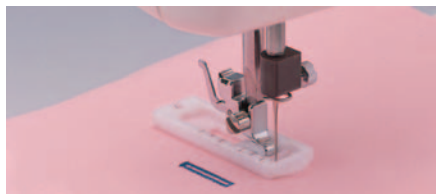
4-STEP AUTOMATIC BUTTONHOLER