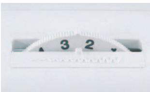
STITCH WIDTH & NEEDLE POSITION ADJUSTMENT