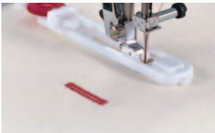
1-STEP AUTOMATIC BUTTONHOLER