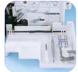
Built-in accessory storage