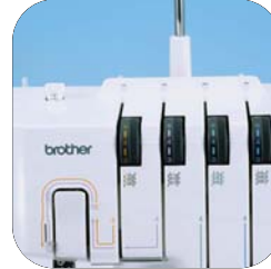
4 colour easy threading guide